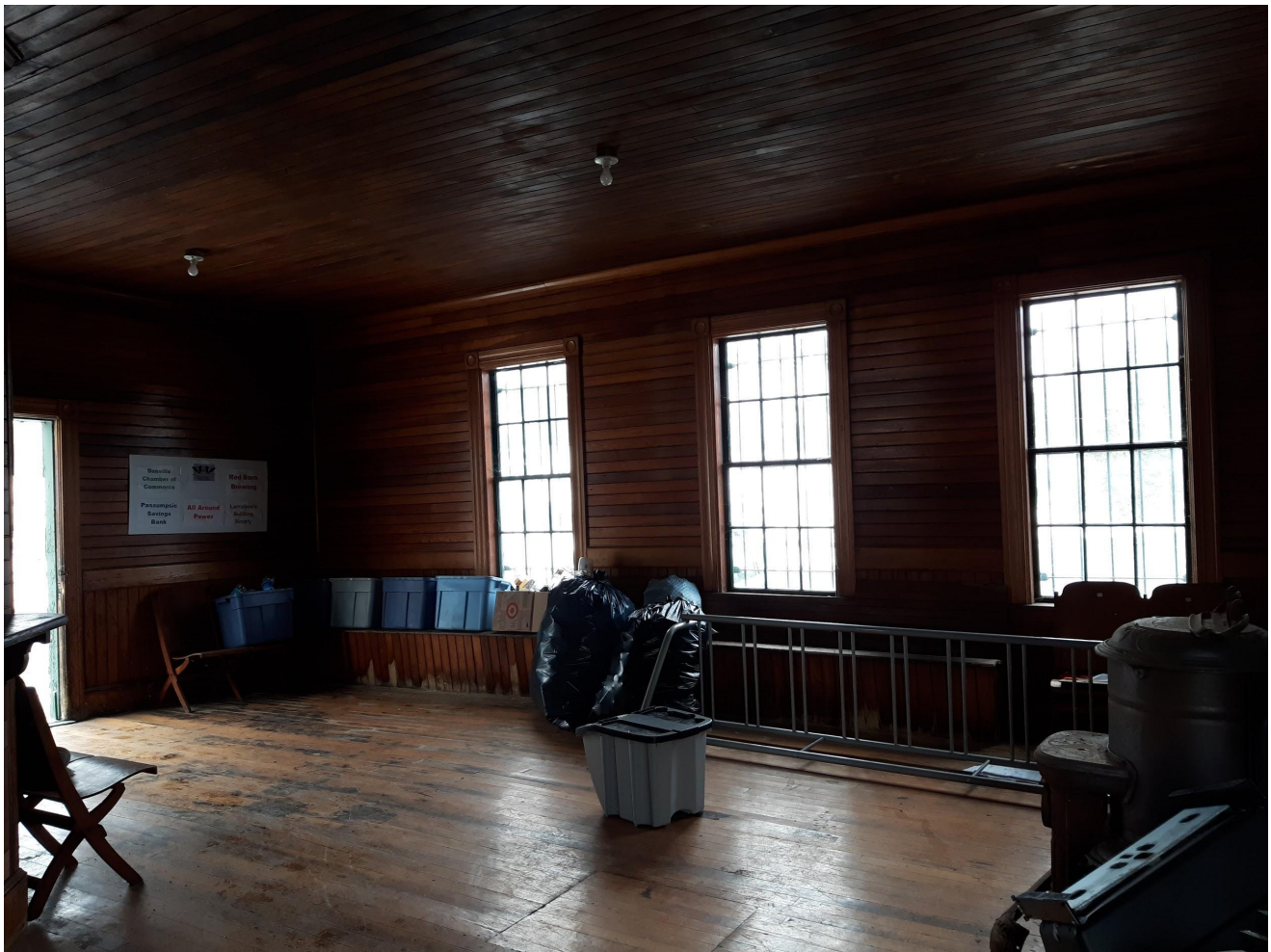
Waiting room looking northwest