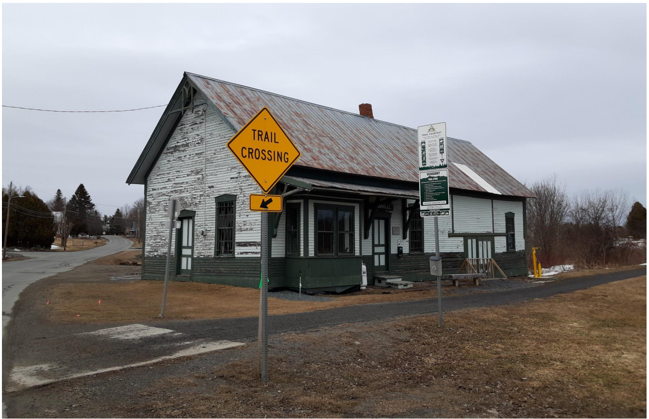
View of the Railroad station looking northeast