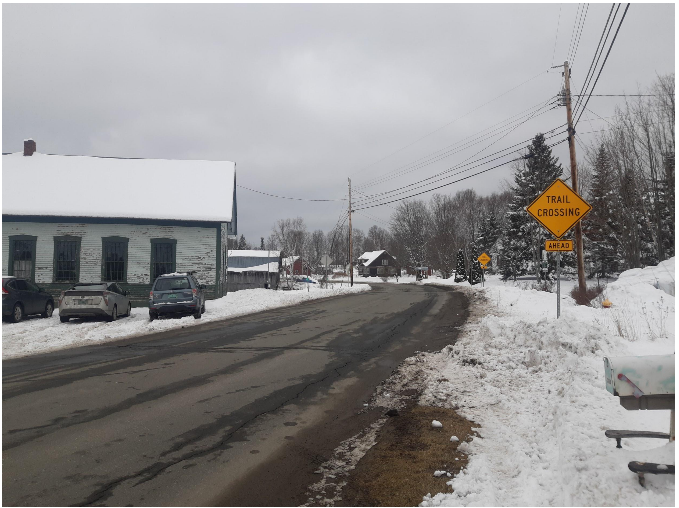
Peachum Road, looking south