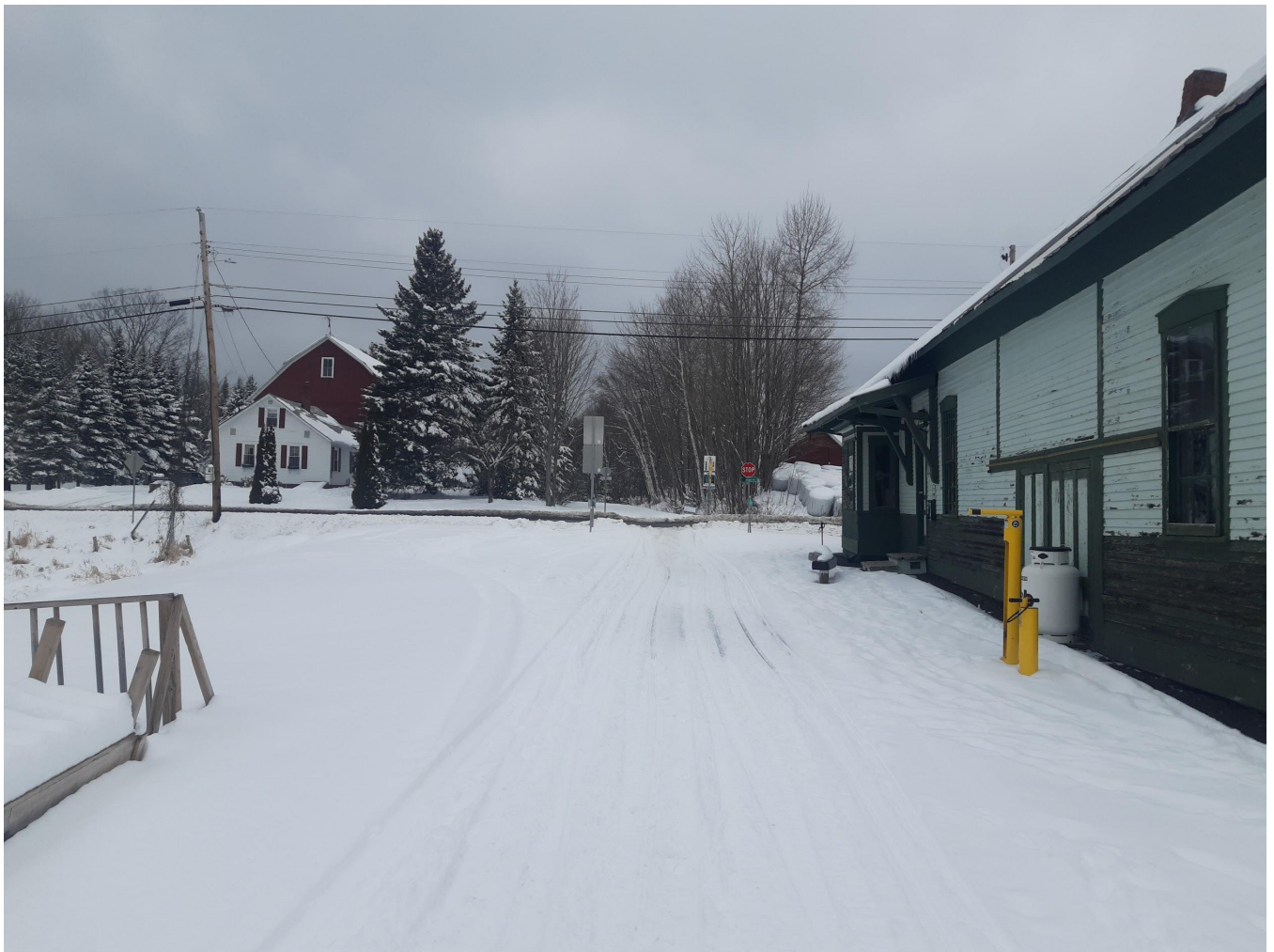
Lamoille Valley Rail Trail, looking west