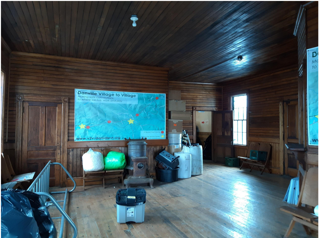
Waiting room looking east