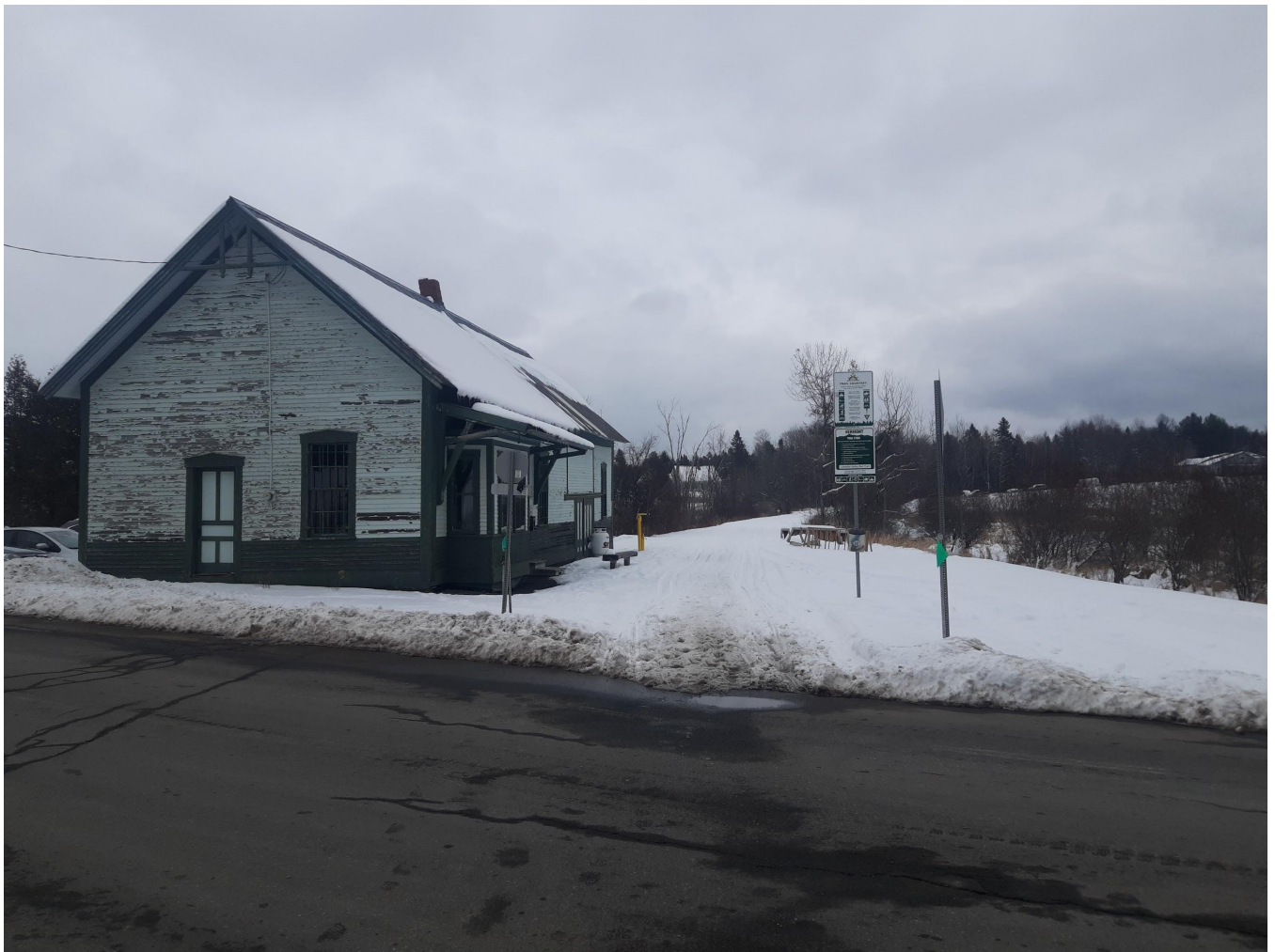
Lamoille Valley Rail Trail, looking east