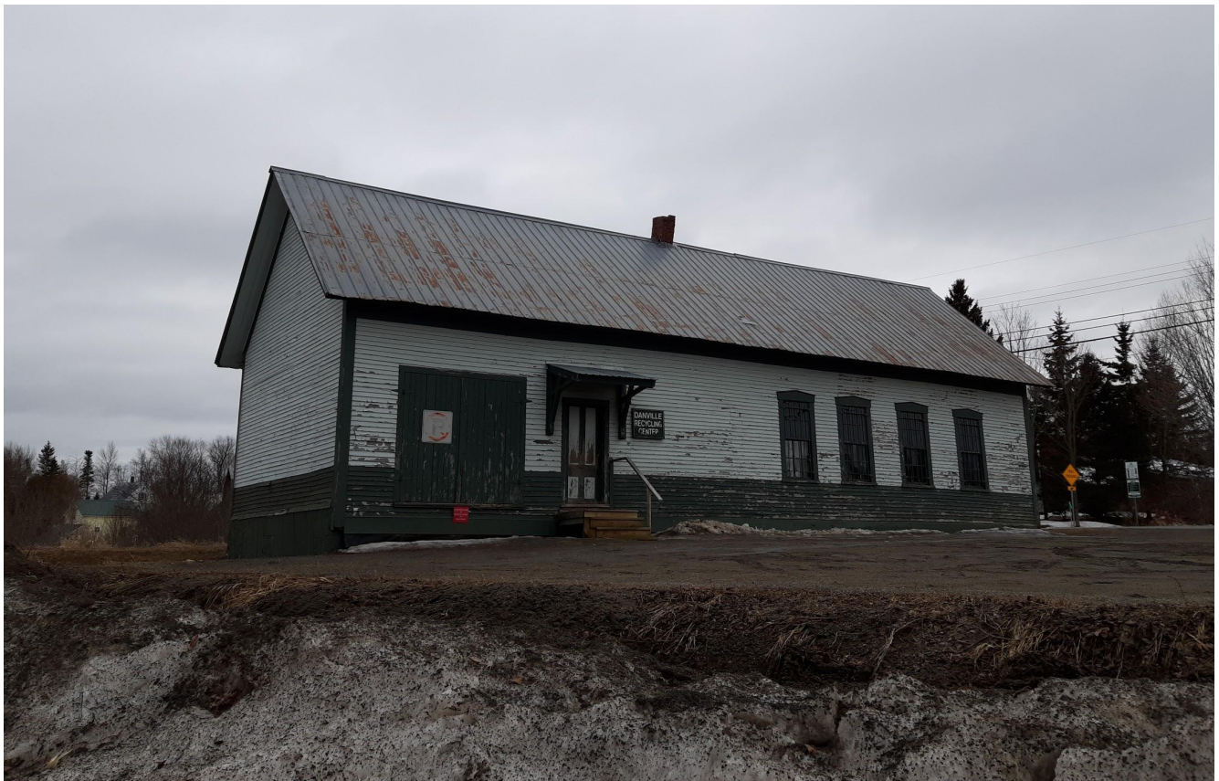
View of Railroad Station looking southwest