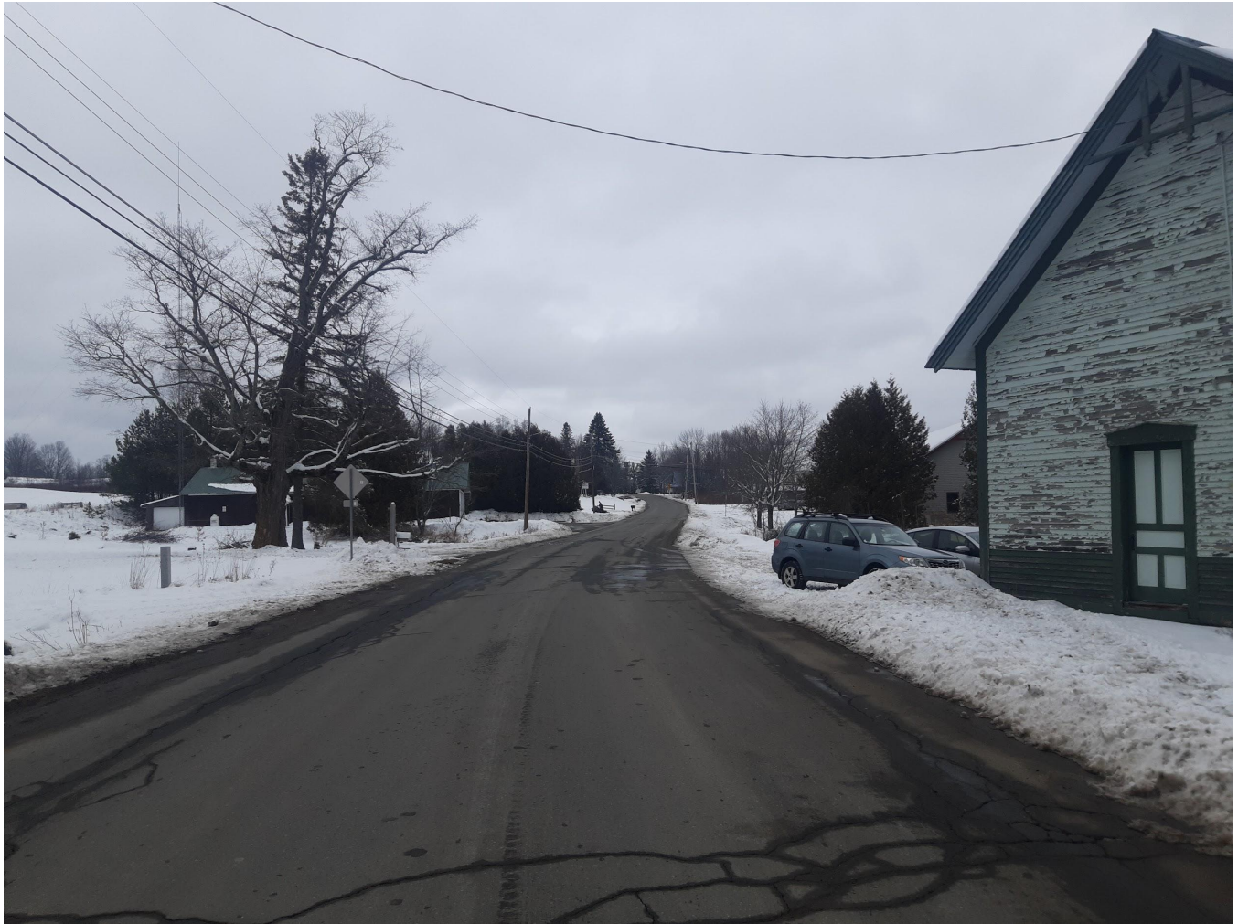
Peachum Road, looking north

District: recent photographs of the buildings, structures and/or objects in the district; and streetscape views showing how the resources relate to each other. If possible, include copies of historic photographs of the district as well.